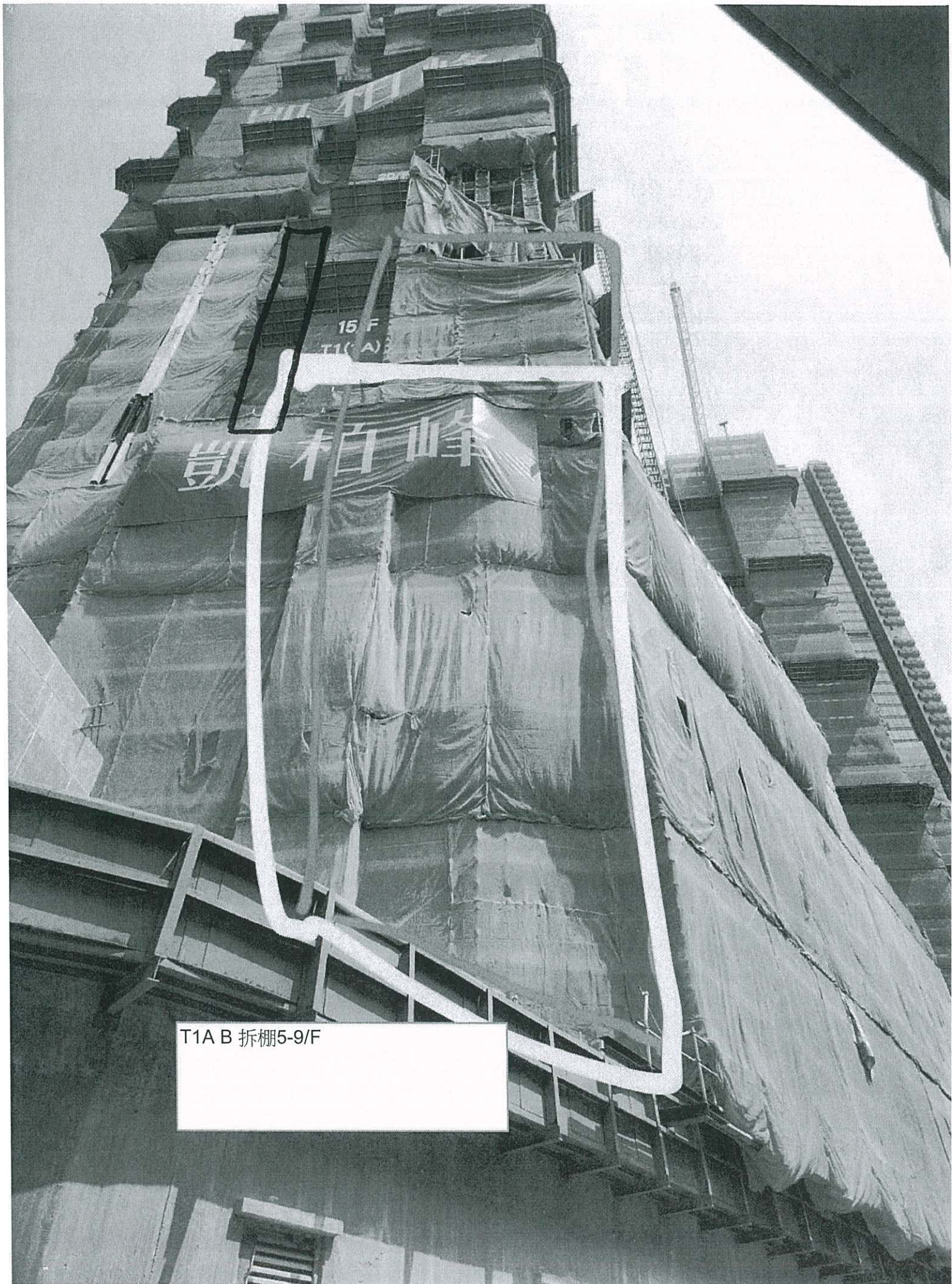
T1A B 拆棚5-9/F